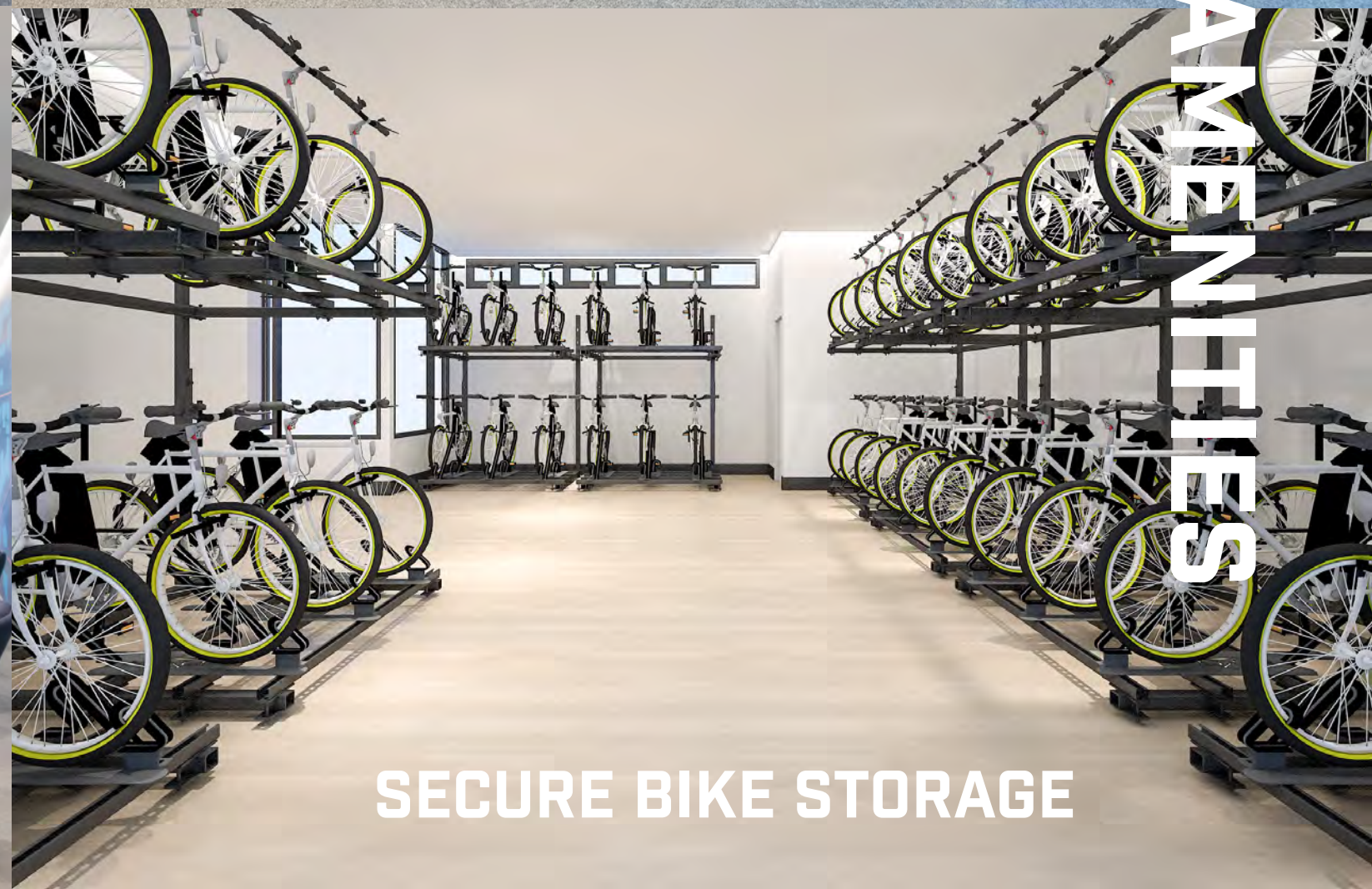
SECURE BIKE STORAGE